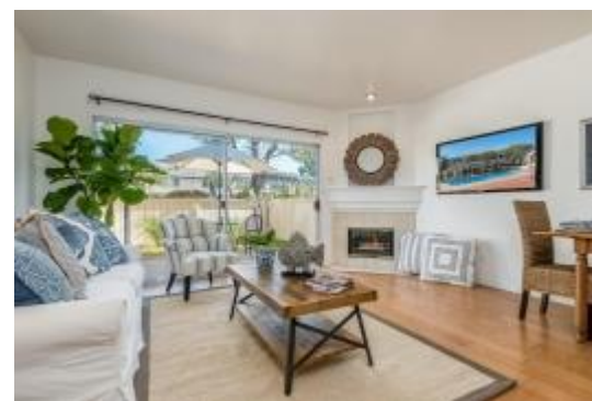
7064 Marymount Way, Goleta CA 93117

We provide special member benefits to show how much we appreciate your support.