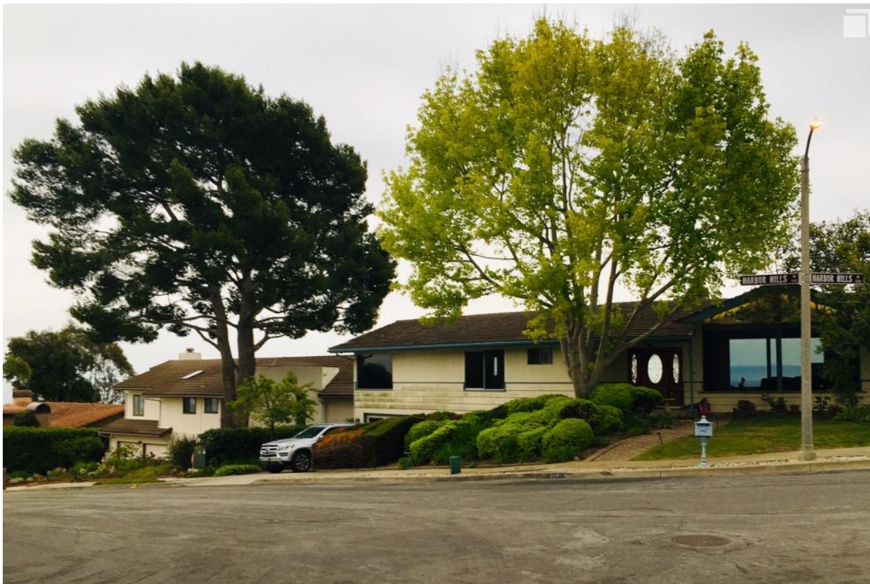
Among the upgrades proposed for a single-family house at 1199 Harbor Hills Drive in Santa Barbara are decks to take better advantage of the ocean views from the Mesa property.

5-2 vote reverses design review board rejection of backyard deck overlooking neighboring front yard and within setback buffer