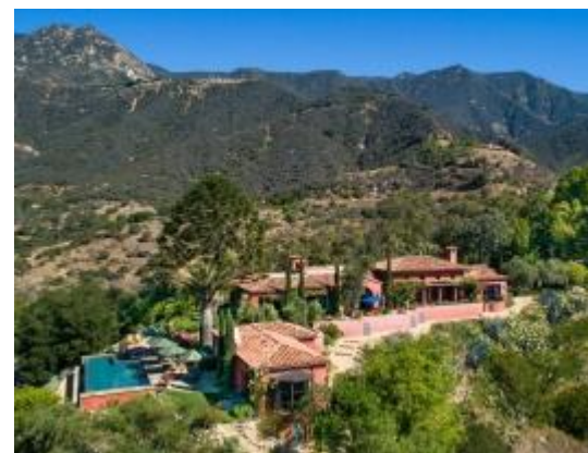
3090 Hidden Valley Lane, Montecito 93108